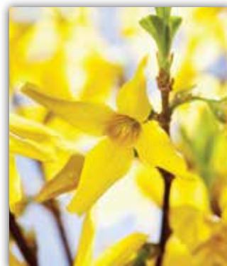
LYNWOOD GOLD FORSYTHIA