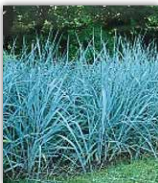
BLUE LYME GRASS - (PAGE 19)