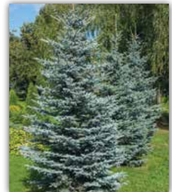
COLORADO BLUE SPRUCE