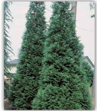
GREEN GIANT PYRAMIDAL ARBORVITAE