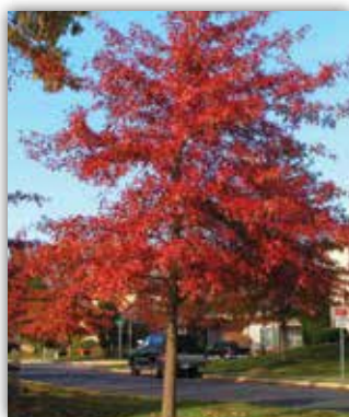
PIN OAK ( FALL COLOR)