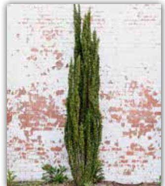
JAPANESE SKY PENCIL HOLLY