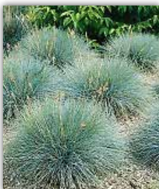
BLUE FESCUE GRASS - (PAGE 19)