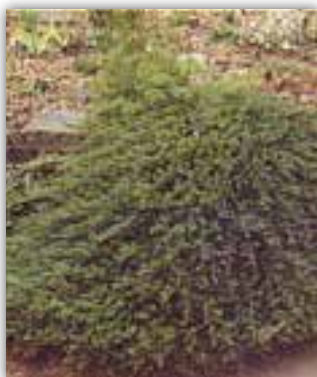
BAR HARBOR JUNIPER