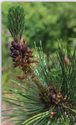
JAPANESE BLACK PINE