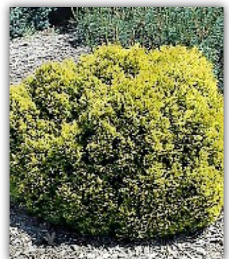
RHEINGOLD GLOBE ARBORVITAE