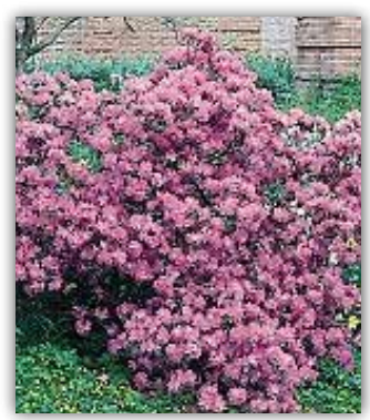
DWARF RHODODENDRON - (PAGE 18)