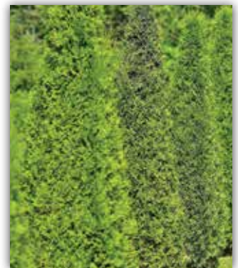
EMERALD GREEN PYRAMIDAL ARBORVITAE