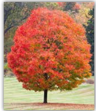
SUGAR MAPLE (FALL)