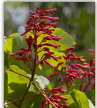
RED BUCKEYE - (PAGE 8)