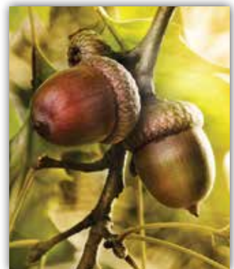
RED OAK ACORNS (FALL) - PG. 12