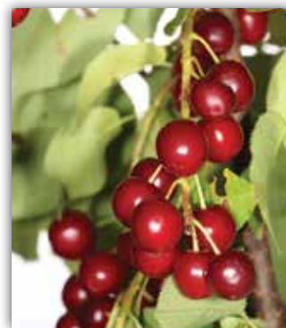
CHOCHECHERRY - PG. 8