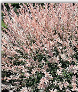
DAPPLED HAKURO NISHIKI WILLOW