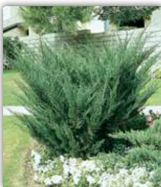
SEA GREEN JUNIPER