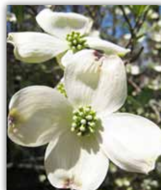
WHITE FLOWERING DOGWOOD