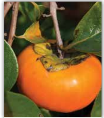
AMERICAN COMMON PERSIMMON