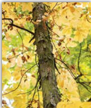
SHAGBARK HICKORY (FALL)