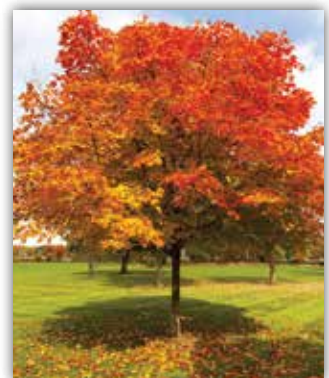
RED OAK ( FALL COLOR) - PG. 12