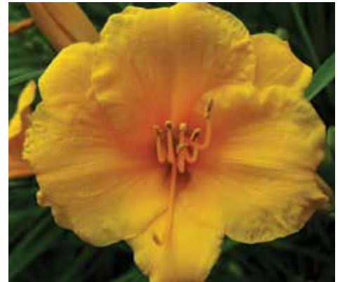
STELLA D'ORO DAYLILY