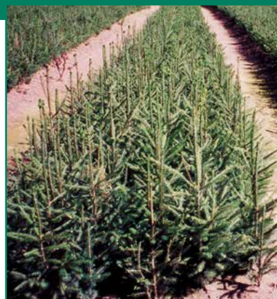
NORWAY SPRUCE TRANSPLANTS

Agricultural regulations in specific states prohibit the shipment of the following items: AZ: Butternut, Hickory, Pecan, Walnut; AR: Walnut; CA: Apple, Butternut, Cherry, Chestnut, Chokecherry, Crabapple, Hickory, Hollyhock, Juniper, Oak, Pecan, Persimmon, Plum, Redcedar, Walnut; CO: Following Cherry (Mahaleb, Montmorency, Sweet, Wild Black), Plum; FL: Chestnut, Dogwood, Oak; MA: Barberry, Black Locust, Burning Bush; ME: Hemlock; MI: Chestnut, Hemlock, Walnut; MN: Barberry, Walnut; MO: Walnut; NE: Barberry, Walnut; NH: Barberry, Burning Bush, Hemlock; NM: Butternut, Hickory, Pecan, Walnut; NY: Barberry; NC: Walnut; ND: Barberry; OH: Barberry, Hemlock; OR: Blueberry, Following Cherry (Mahaleb, Montmorency, Purpleleaf Sand, Wild Black), Chestnut, Chokecherry, Hollyhock, Oak, Plum; TX: Butternut, Hickory, Pecan, Walnut; VT: Barberry, Hemlock; WA: Barberry, Blueberry, Cherry, Chestnut, Chokecherry, Hollyhock, Plum. Conifers to WI require a phyto certificate of inspection for Hemlock Scale. Please note: All regulated items listed above may not be available in our current catalog. Agriculture regulations are subject to change without prior written notice. All orders subject to change according to current regulations.