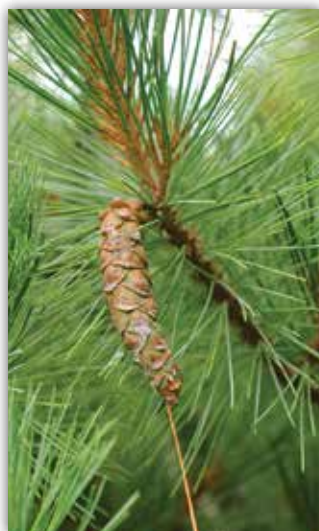
EASTERN WHITE PINE

Each year we produce a variety of native conifer and hardwood seedlings and transplants along with ground covers, landscaping shrubs and perennials. We offer the broadest selection of plant material available from one nursery. Musser Forests grown plants are shipped throughout the entire United States.