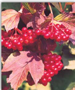
AMERICAN CRANBERRY VIBURNUM

AMERICAN CRANBERRYBUSH VIBURNUM ☀️🌙 Viburnum trilobum • Zone 2-7 • A deciduous shrub, growing 8 to 12 feet with a spread to 8 to 12 feet. White flowers, in clusters in May. Bright red berries early September through fall into February, which provide food for birds. People used to make jelly from the berries. Use as a screen or a background plant, space 4 feet apart. A good wetland plant.