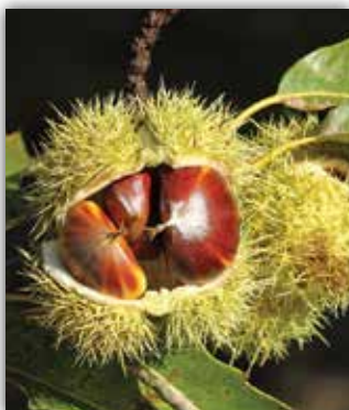
AMERICAN CHESTNUT (FALL)