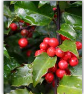
BLUE GIRL HOLLY