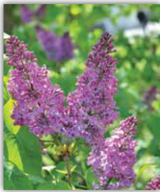
OLD FASHIONED LILAC