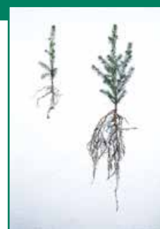
NORWAY SPRUCE REGULAR SEEDLING, LEFT PRECISION SOWN, RIGHT