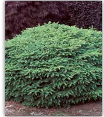
BIRD'S NEST SPRUCE