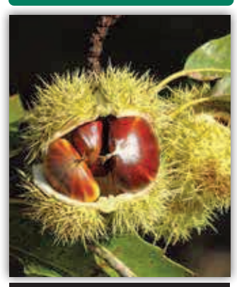
AMERICAN CHESTNUT (FALL) - PG. 7