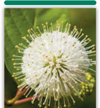
BUTTONBUSH - PG. 7