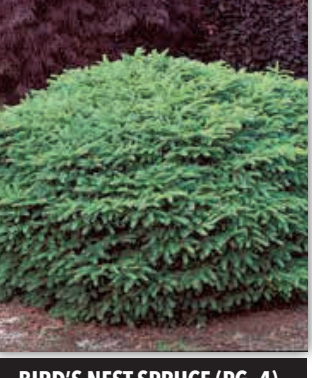
BIRD'S NEST SPRUCE (PG. 4)