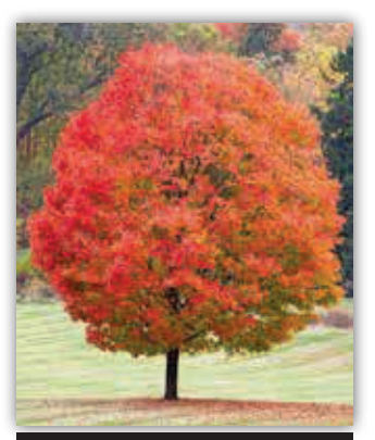
SUGAR MAPLE (FALL) - PG. 10