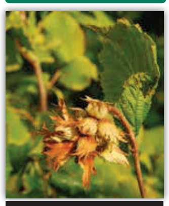
HAZELNUT (FALL) - PG. 9