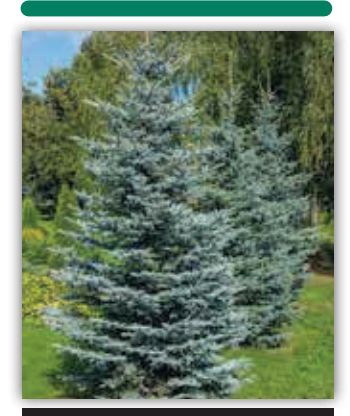
COLORADO BLUE SPRUCE