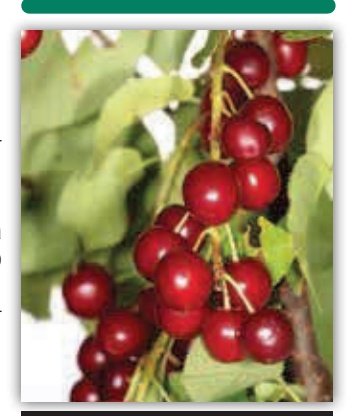
CHOKECHERRY - PG. 8