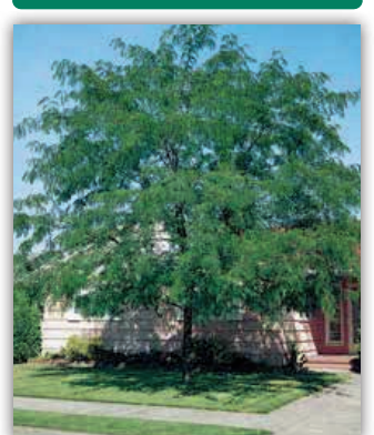
THORNLESS HONEYLOCUST - PG. 9