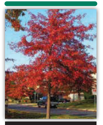
PIN OAK (FALL COLOR)