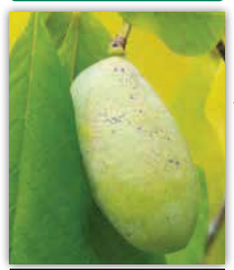
PAW PAW - PG. 11