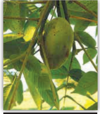
BUTTERNUT (FALL) - PG. 7

CHINESE CHESTNUT Castanea mollissima • Zone 4-8 • Growth to 20 to 25 feet. Turns yellow to bronze in fall. Grows best in full sun; deep, sandy loam. These dense and round headed ornamental trees bear large, sweet, delicious edible nuts. Although, self fertile, it is best to plant two or more for best pollination and nut production. Should start bearing nuts in 3 to 5 years. Blight resistant. No shipments to CA, FL, MI, OR, WA.