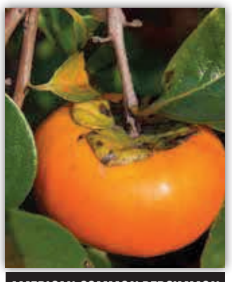
AMERICAN COMMON PERSIMMON