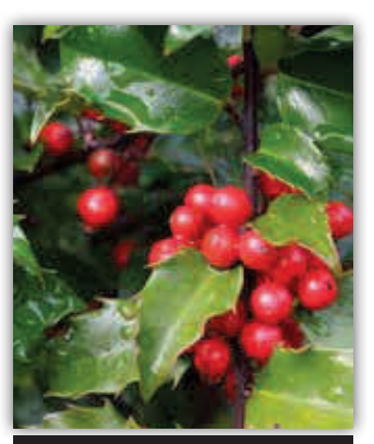
BLUE GIRL HOLLY - PG. 6