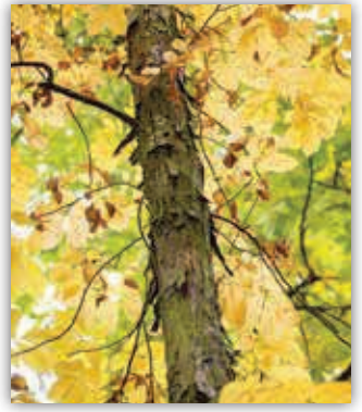
SHAGBARK HICKORY (FALL) PG. 9