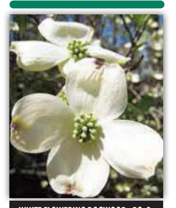
WHITE FLOWERING DOGWOOD - PG. 8 \,