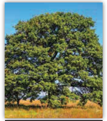
WHITE OAK - PG. 11

AMERICAN COMMON PERSIMMON Dissipation by Diospyros virginiana • Zone 4-9 • A native tree 25 to 40 feet in height and 20 to 35 feet in width. Common Persimmon is slender with an oval-rounded crown, often very symmetrical. The white, fragrant flowers are very sweet and a favorite of honeybees. An edible persimmon ripens with a deep orange color after several frosts. More than one tree is needed for pollination to produce fruit. Persimmon tends to sucker into groves or colonies, producing food for wildlife. The hard, heavy, close-grained wood is used for golf club heads, billiard cues and flooring. No shipments to CA.