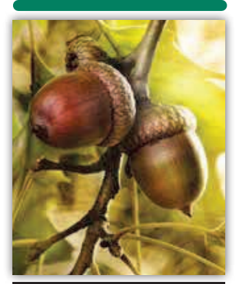
RED OAK ACORNS (FALL)