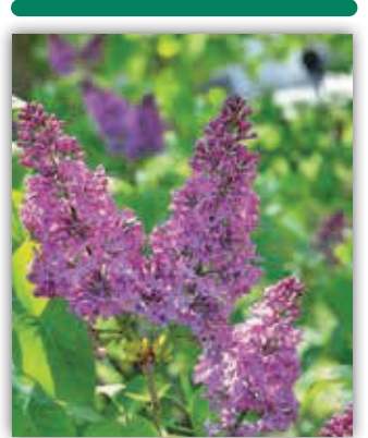
OLD FASHIONED LILAC - PG. 9