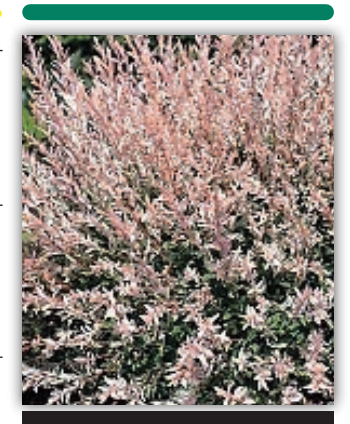
DAPPLED HAKURO NISHIKI WILLOW