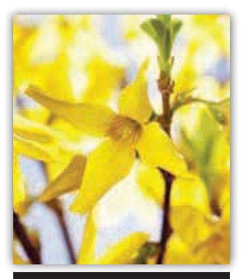
LYNWOOD GOLD FORSYTHIA - PG. 8