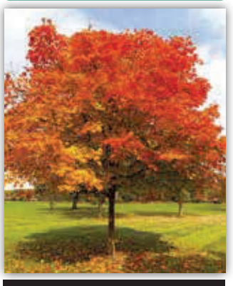
RED OAK (FALL COLOR)